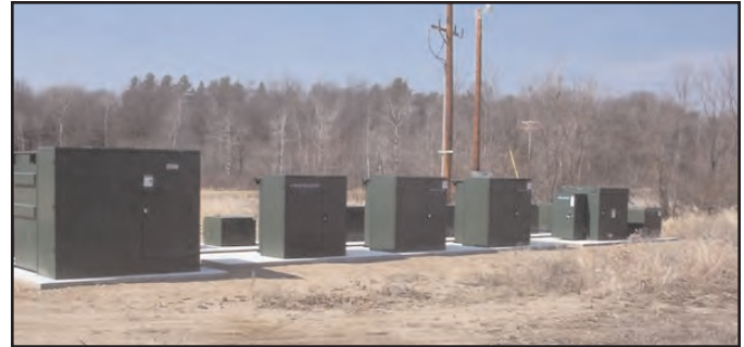
The padmount solution includes a three phase transformer (left), voltage regulators, Viper -ST recloser and numerous single phase switches.

Results: A new, compact, dead-front substation using state-of-the-art recloser technology is now providing reliable power to the new loads. For more information, contact your G&W representative or visit www.gwelec.com .