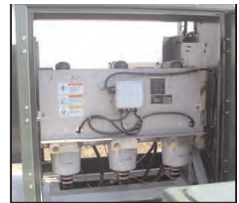
Recloser operator compartment.