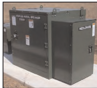
Padmount Viper-ST recloser.