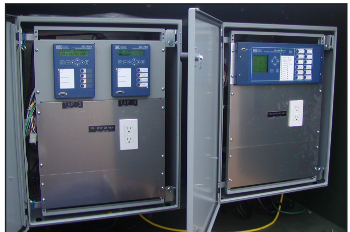
▲ Figure 3: SEL-751As and 451 were mounted in a common enclosure on the side of each switch.

The relay logic was designed to be extremely flexible so the same program could be used in multiple scenarios. This was accomplished using the extensive logic capability and multiple setting groups in the SEL-451 relay. The utility could choose whether to use the switch as a standard automatic transfer switch, as a through point automated loop switch where both line ways are normally closed, or an open point automated loop switch where one line way is normally open.