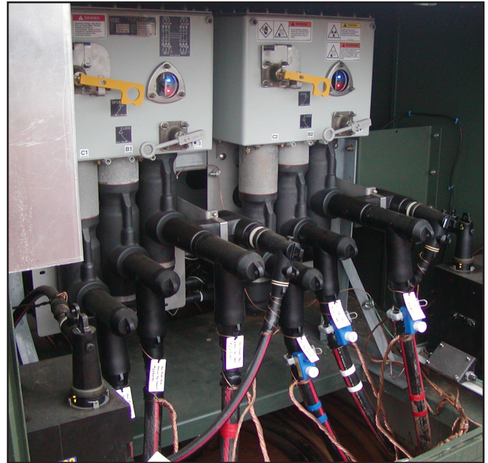
▲ Figure 2: Front/back access padmount switches incorporated two Trident-SR switches on both sides.