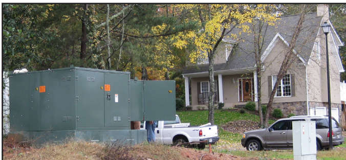
▲ Figure 1: Padmount switch with side control enclosure.

The two source ways of the Trident-SR switches were controlled and protected by SEL-451 relays. The two load ways were controlled and protected by SEL-751A feeder protection relays. G&W designed and built the two relay panels in a common enclosure on the side of the switch. Both panels had 120 V outlets which allowed operators to plug in laptops when working on or near the switches (see Figure 3).