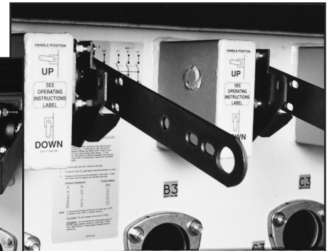
▶ Position indicators (right) provide contact position indication through viewing windows.