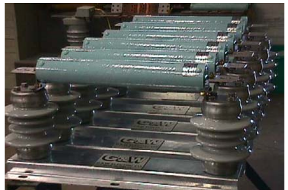
HIGH CURRENT LIMITER WITH BOLTED MOUNT

This is a back-up class of fuse that is meant to clear only the more extreme fault levels. It has a minimum clearing current of 100A when tested per ANSI/IEEE C37.41. It is therefore intended to be used in conjunction with a lower rated (and less costly) device, which will clear the lower fault levels. A pole mounted cutout or expulsion-type power fuse is a typical device.