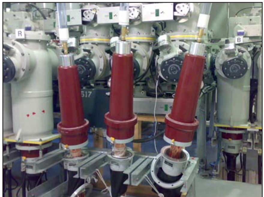
▲ 145kV terminations being prepared for installation in a gas insulated substation