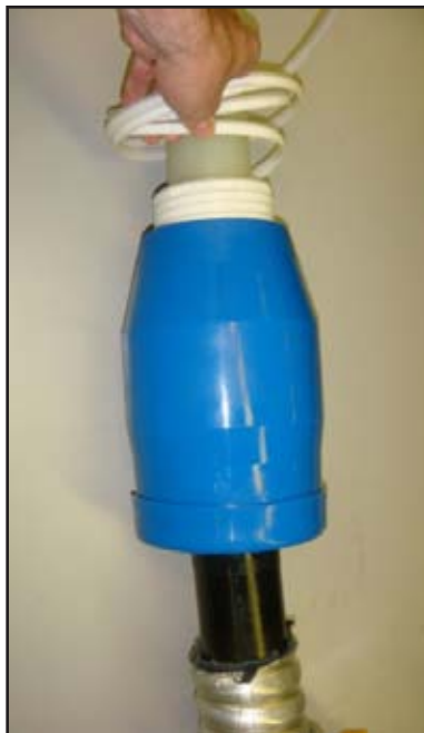
▲ Mechanical shrink stress cone