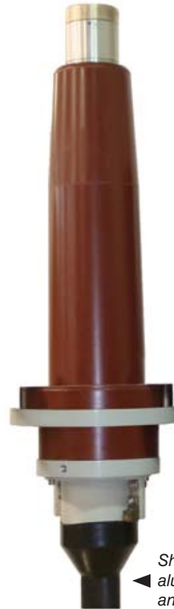
Shown with contact pad, aluminum entrance housing and heat shrink seal.