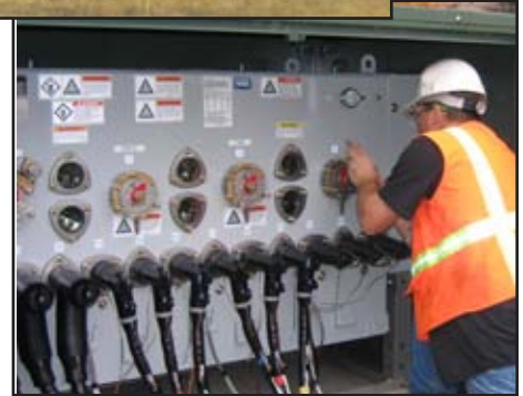
▶ Front access, 4-way switch with integral ground and visible break viewing windows.