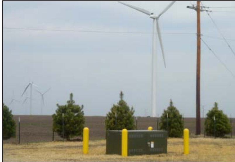
▲ Padmount switch in a collector system.