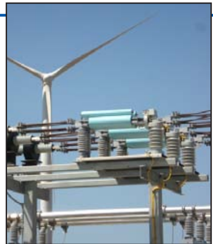
▲ Substation mounted 38kV CLiP

CLiPs can be remotely enabled or disabled. The units provide a remote indication of operation feature permitting integration into a SCADA or other automation scheme to initiate secondary responses set by the utility after a trip has occurred.