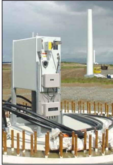
▲ Switches can also be installed and connected prior to tower construction.