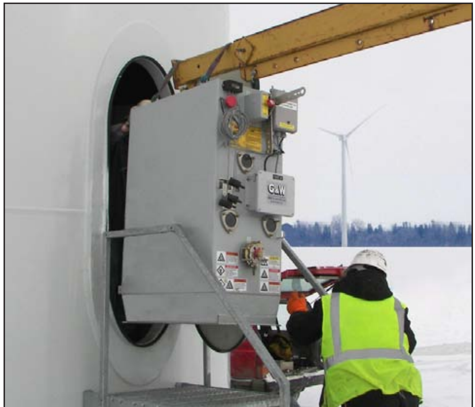
▲ Compact vertical design fits through the typical entrance opening for installation after the tower is constructed.