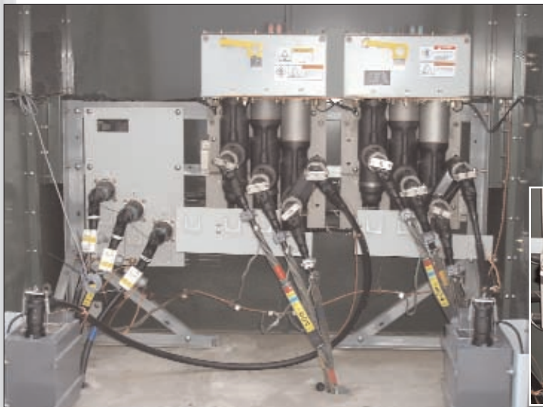
Photo left: Shows two switched source ways and one load side way (far left). Solid dielectric PTs are in the lower left and right corners.

For more information: Contact your G&W representative or visit www.gwelec.com . G&W offers a variety of automatic transfer switches with transfer times from 8 cycles through 8 seconds.