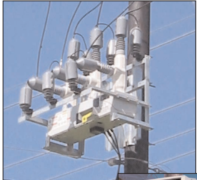
15kV Viper recloser with SEL 351-R control.

When the preferred source voltage is lost, the automatic transfer logic sends a signal to open the recloser. Once the open position status is confirmed, a signal to close the alternate source recloser is activated.