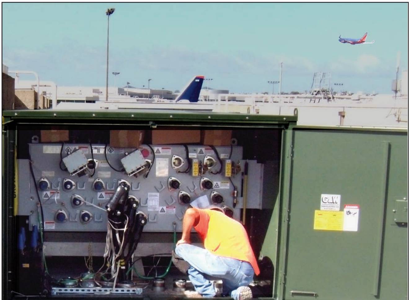
Automated multi-way switch with SEL 451 relays mounted in a side compartment.

Because the entire solution needed to be functional within a very aggressive timeframe, they wanted a “plug & play” solution that would be fully assembled, programmed, and tested before shipment, so as to eliminate any onsite integration or implementation issues that might delay the completion of the project. They also wanted a system that could be installed by their high voltage electrical contractor, who did not have any special expertise in automation systems.