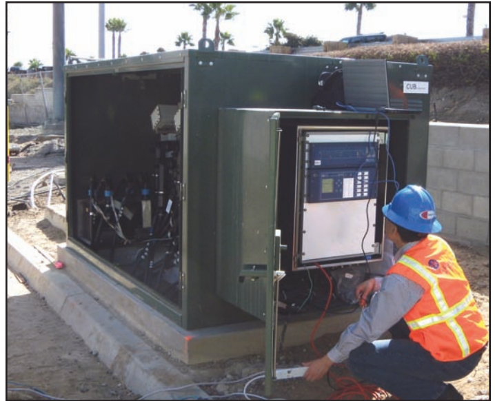
The SEL 1102 central processing unit is mounted within one of the SEL 451 relay cabinets on the side of the switch.

For more information: Contact your G&W representative or visit www.gwelec.com