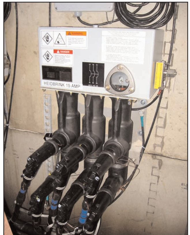
Figure 2: Three phase interrupter mounted to vault wall. Operating handle permits manual reset of all three phases and is accessible from above ground using a hookstick.