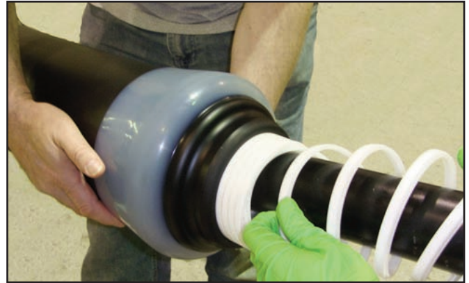
▲ Mechanical shrink construction greatly simplifies installation without the need for special tools.

G&W's PMJ Python™ premolded rubber joints are available for 145kV to 245kV extruded dielectric cable systems. The premolded joint is part of G&W's latest Python™ family of dry type cable accessory products. G&W has been a leading supplier of innovative underground cable accessory solutions since it was founded in 1905. With installations and sales representation worldwide, G&W continues to offer the latest technology products with world-class, time-proven performance. G&W is ISO 9001: 2000 registered for its quality systems. G&W offers a wide variety of terminations and joints for all types of cable construction through 500kV.